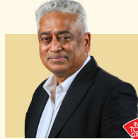
RAJDEEP SARDESAI CONSULTING EDITOR INDIA TODAY TV