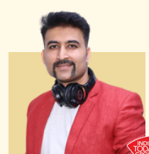
RJ LUCKY 104.8 ISHQ FM INDIA TODAY GROUP